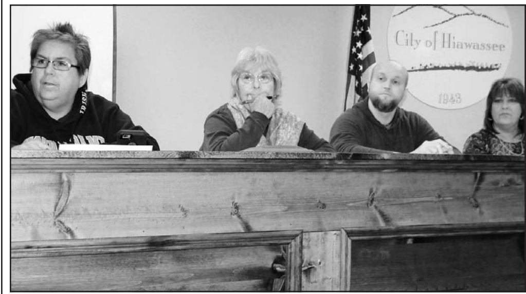
Hiawassee City Council

going to work together. That's what I'm asking from each person who plays a part in this.