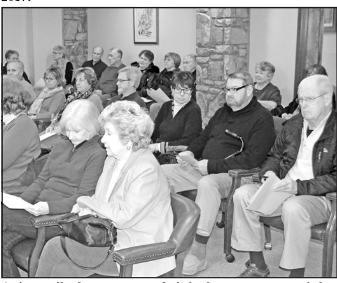
As is usually the case, every chair in the room sat occupied as the council met to conduct city business.